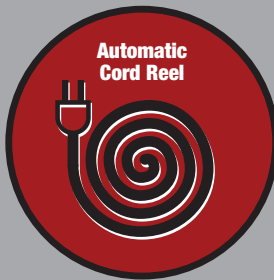
Automatic Cord Reel

A single touch activates the cord rewind mechanism making storage easy and convenient.