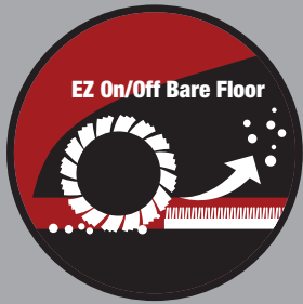
EZ On/Off Bare Floor